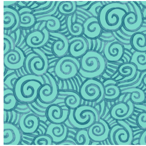
TUMULTE Menthe 122 Print pattern