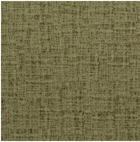
MURA OLIVE 61