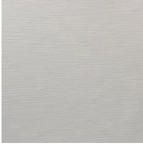
SOLLY BPI 00 Printing support