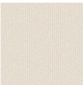
METIS Ivoire 115