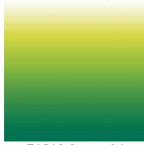
ZADIG Cactus 36