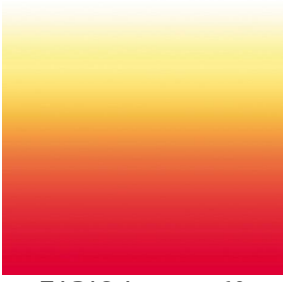
ZADIG Agrume 69