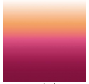
ZADIG Pivoine 57