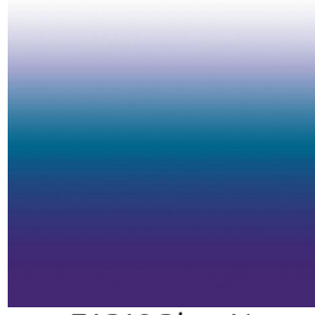
ZADIG Bleu 41