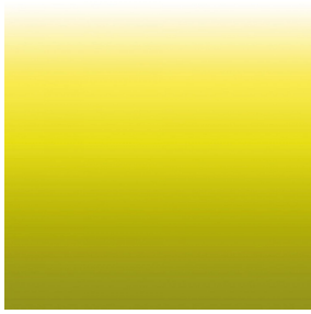
ZADIG Anis 62 Print pattern