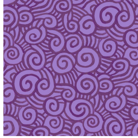
TUMULTE Lilas 19 Print pattern