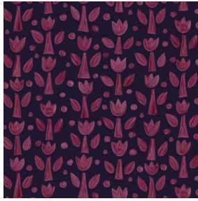
TULIPE Bordeaux 04