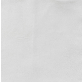
TAO BPI 00 Printing support