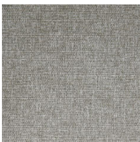
MUNA Chanvre 72