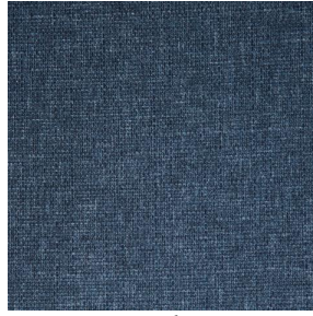
MUNA Indigo 144