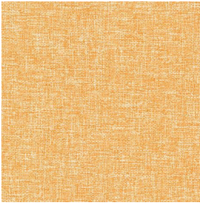
MUNA Melon 22