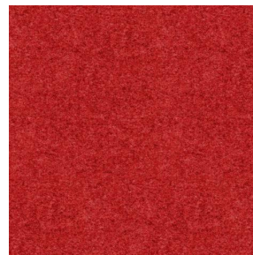
ELAINA Rouge 21