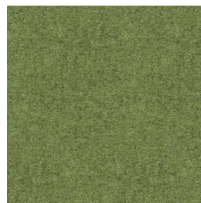
ELAINA Lierre 124