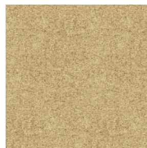
ELAINA Beige 63