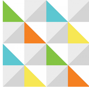
VICTORIEN multico 98 Print pattern