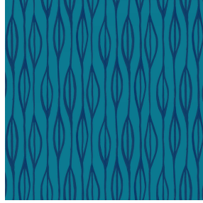
YENDI Pacifique 54 Print pattern