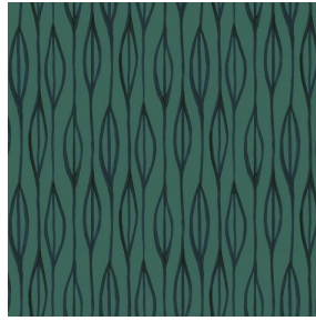
YENDI Sapin 126