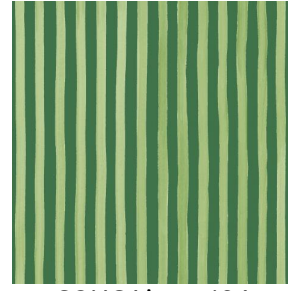
SONG Lierre 124