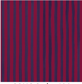
SONG Opéra 104