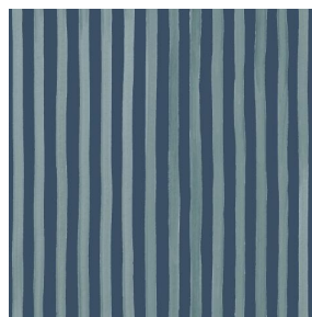
SONG Titanium 98