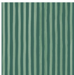
SONG Sapin 126