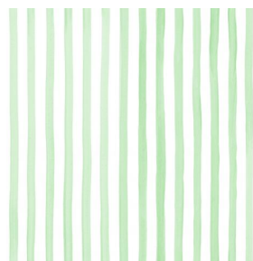
SONG Tilleul 103