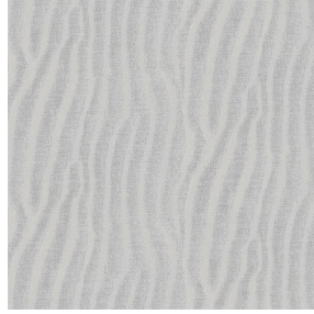
SABLE Souris 31 Print pattern