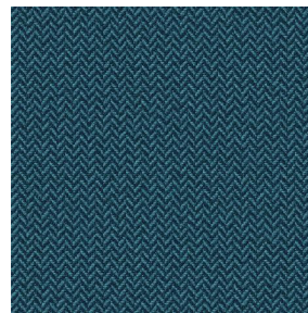
SCOURTIN Céladon 135