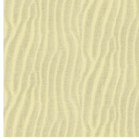
SABLE Sable 67 Print pattern