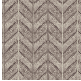
NERVURE Anthracite 38 Print pattern