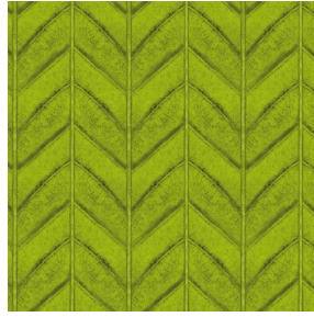
NERVURE Mousse 92