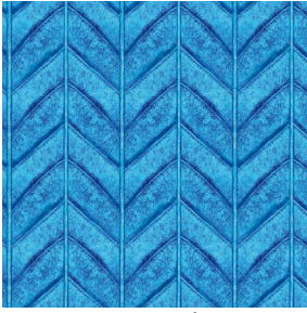
NERVURE Bleu 41