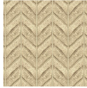
NERVURE Naturel 26