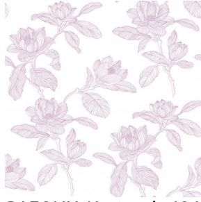
PAEONIA Hortensia 134