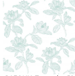
PAEONIA Turquoise 53