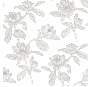
PAEONIA Titanium 98 Print pattern