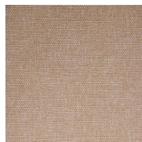
MUNA Saumon 143