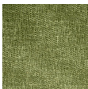
MUNA Olive 61