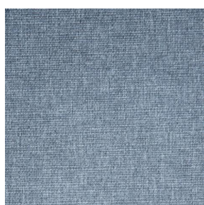
MUNA Tourterelle 138