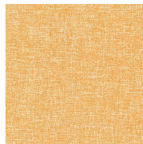
MUNA Melon 22