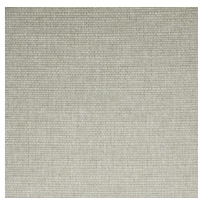
MUNA Coco 142