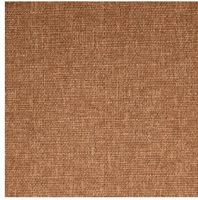
MUNA Sienne 29 Print pattern