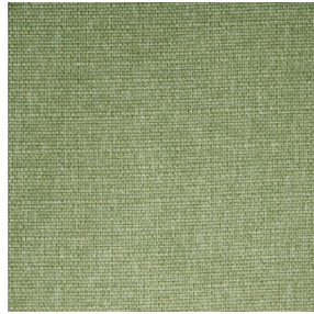
MUNA Tilleul 103 Print pattern