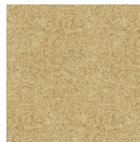
ELAINA Beige 63