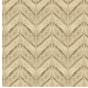
NERVURE Naturel 26 Print pattern