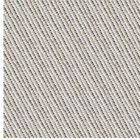
PIERRETTE Naturel 26 Print pattern