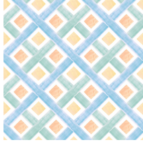
ARIA Multico 98 Print pattern