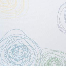
NAHIA TURQUOISE 53