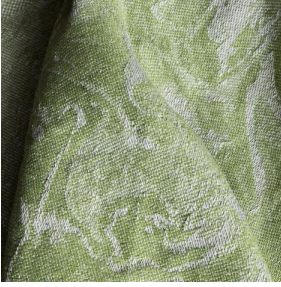
IMMERSION SIENTA Mousse 92