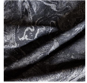
IMMERSION SIENTA Sisal 140