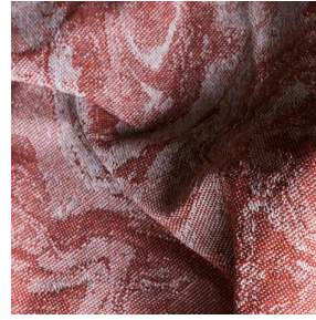
IMMERSION SIENTA Châtaigne 55